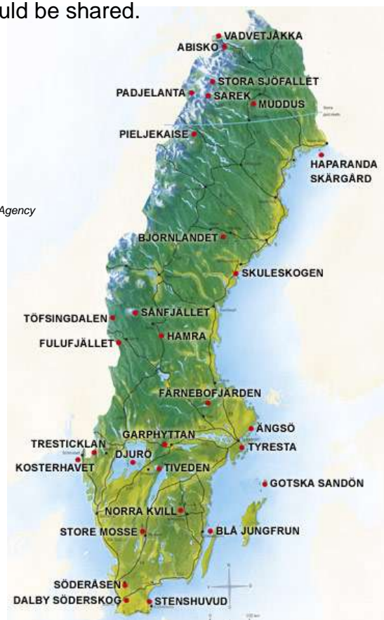
Illustration: Hans Sjögren, Copyright: Swedish Environmental Protection Agency

The ambitious study tour was designed to cover the breadth of work covered in my role here in Scotland and each Swedish National Park (Tyresta, Söderåsen and Stenshuvud) chosen had different work priorities and therefore a diverse range of priority issues and work practices could be shared.