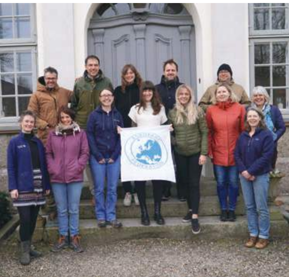
Participants of the Siggen Seminar 2024.

Learn more about the Siggen Seminar here .