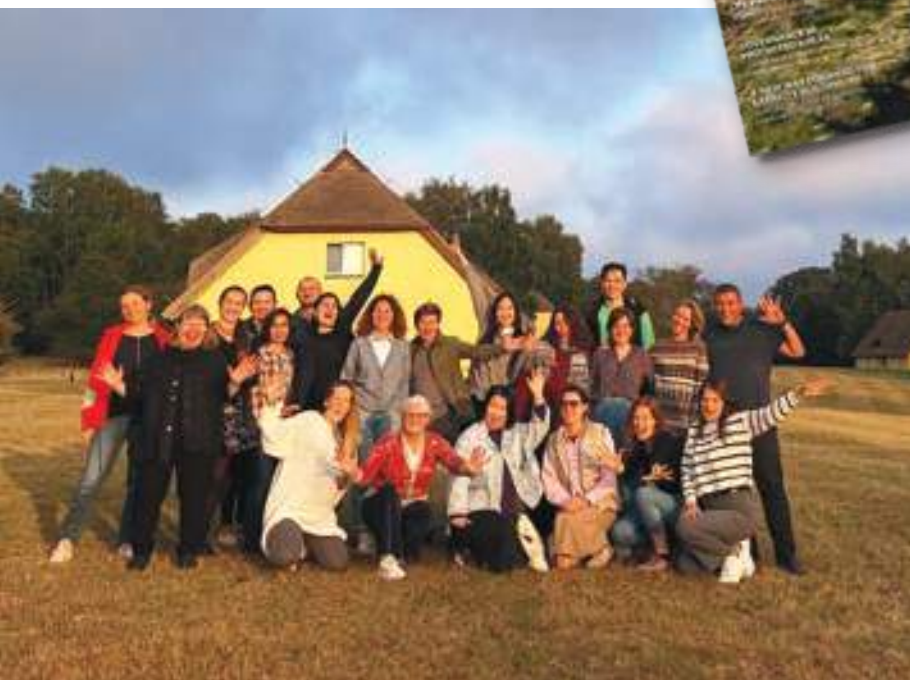
Klaus Toepfer Fellowship Programme Vilm Germany.

The EUROPARC module covered a range of topics, including the rationale and history of Protected Areas, their definitions and values, IUCN Protected Area Management Categories, international agreements and negotiations related to Protected Areas, and effective communication strategies for Protected Areas. The training was designed to ensure that all participants gained a comprehensive understanding of these critical topics and how they can be applied in diverse regions and communities.