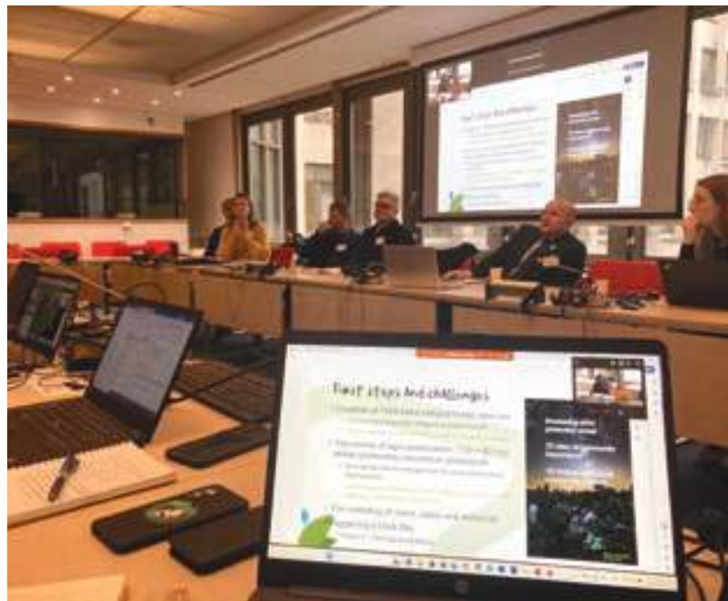
Seminar Dialogue 2024.

EUROPARC participated actively in expert working groups of the Bern Convention under the Council of Europe offering advice on indicators for the Bern Convention Strategic Plan, especially regarding Protected Areas. Additionally, we participated in the first meeting of the Council of Europe’s Landscape Convention in several years: this provides an important platform to share our Members’ expertise on landscape approaches and management.