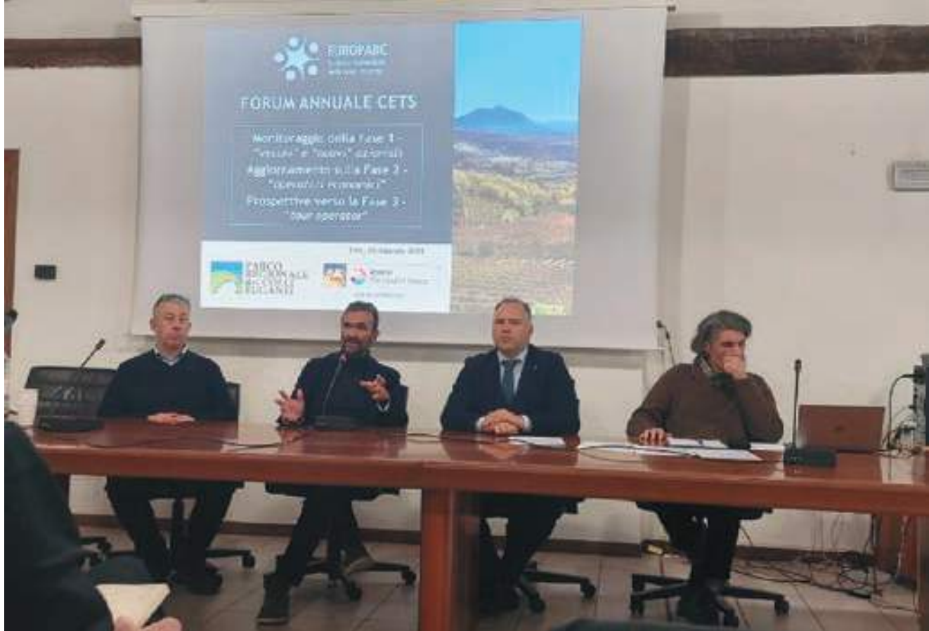
CETS MEETING with Parco Regionale Colli Euganei, Italy.