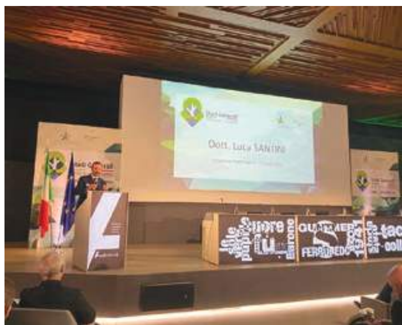
Stati Generali delle Aree Protette, general meeting of Italian Protected Areas in Rome, December 2024.

This two-day event gathered park representatives from various parties and institutions, including Minister Gilberto Pichetto Fratin (from the Italian Ministry of Environment and Energy Security) and many other members of the Italian government. The high-level discussion and debate on the situation and prospects of Italian Protected Areas included the possibility of updating the Italian parks law (no. 394/1991). The goal is to make the functioning of park authorities more effective and efficient in their mission of biodiversity protection, whilst also aiming to create an integrated system of Italian Protected Areas.