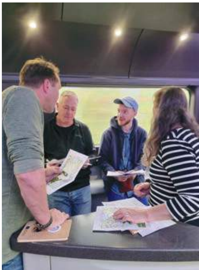
Climate change game on the train.