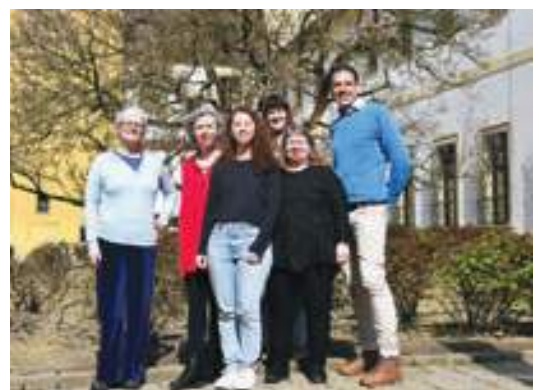
Wilder Parks Meeting in Regensburg, Germany.

To further disseminate information on rewilding to EUROPARC Members, a new section "Rewilding and Protected Areas" was established as a part of the EUROPARC Knowledge Hub. This section features case studies provided by EUROPARC members showcasing their rewilding experiences and insights.