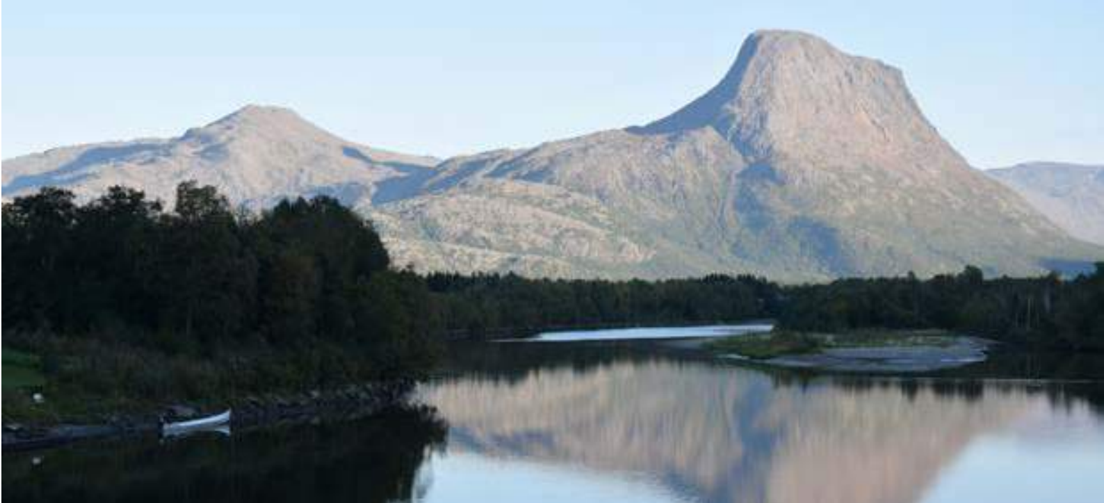
Háldi Transboundary Area, Finland and Norway.