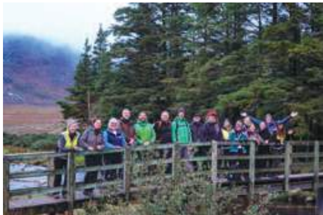
Participants of the ECST network meeting 2024.

Learn more about the ECST network meeting here.