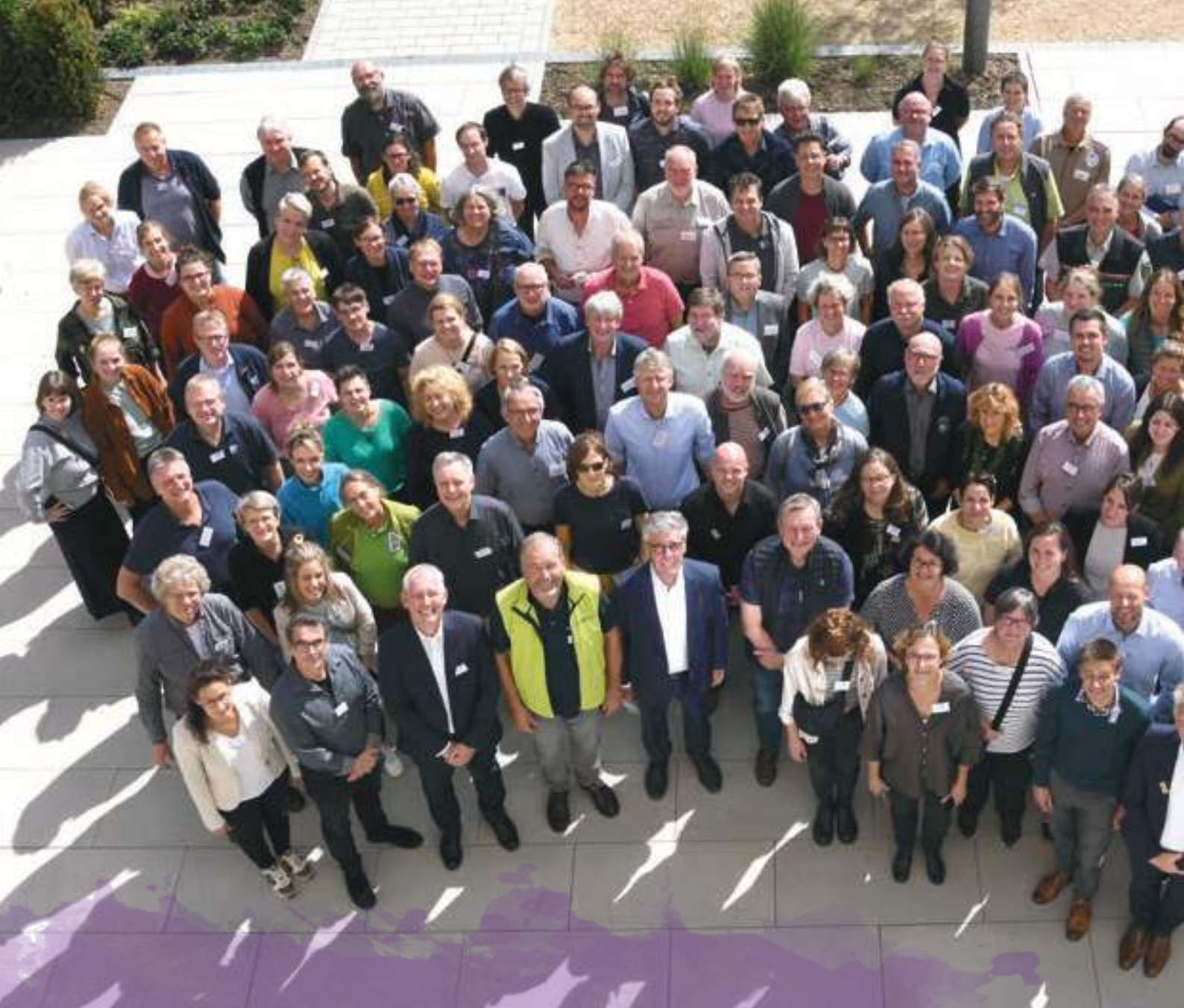
Annual conference of NNL e. V. and VDN e. V. including the founding event of the National Natural Landscapes Foundation