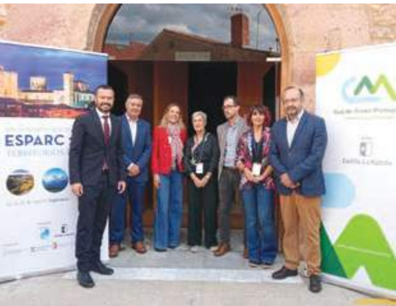
Official opening of ESPARC 2024, XXII Conference of EUROPARC Spain.

The XXII Conference of EUROPARC Spain was held in Sigüenza, in the Castilla-La Mancha region. The event brought together 170 participants from across Spain. The workshops analysed key topics such as the conservation and restoration of natural systems, the incorporation of climate change into management, the contribution of Protected Areas to demographic challenges, the compatibility between tourism and conservation, the communication of the social benefits derived from Protected Areas and their enhancement as spaces for people's health.