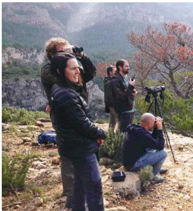
Field visit during the IV Technical Seminar of RedBosques_Clima, held in Ports Natural Park.

In 2024, the first mobility exchange under the project was carried out in Sierra Norte de Guadalupe Natural Park, with the participation of ten professionals. Additionally, the fourth technical seminar was held in Ports Natural Park, where twenty attendees shared nature-based solutions for adapting forest ecosystems in Protected Areas to climate change.