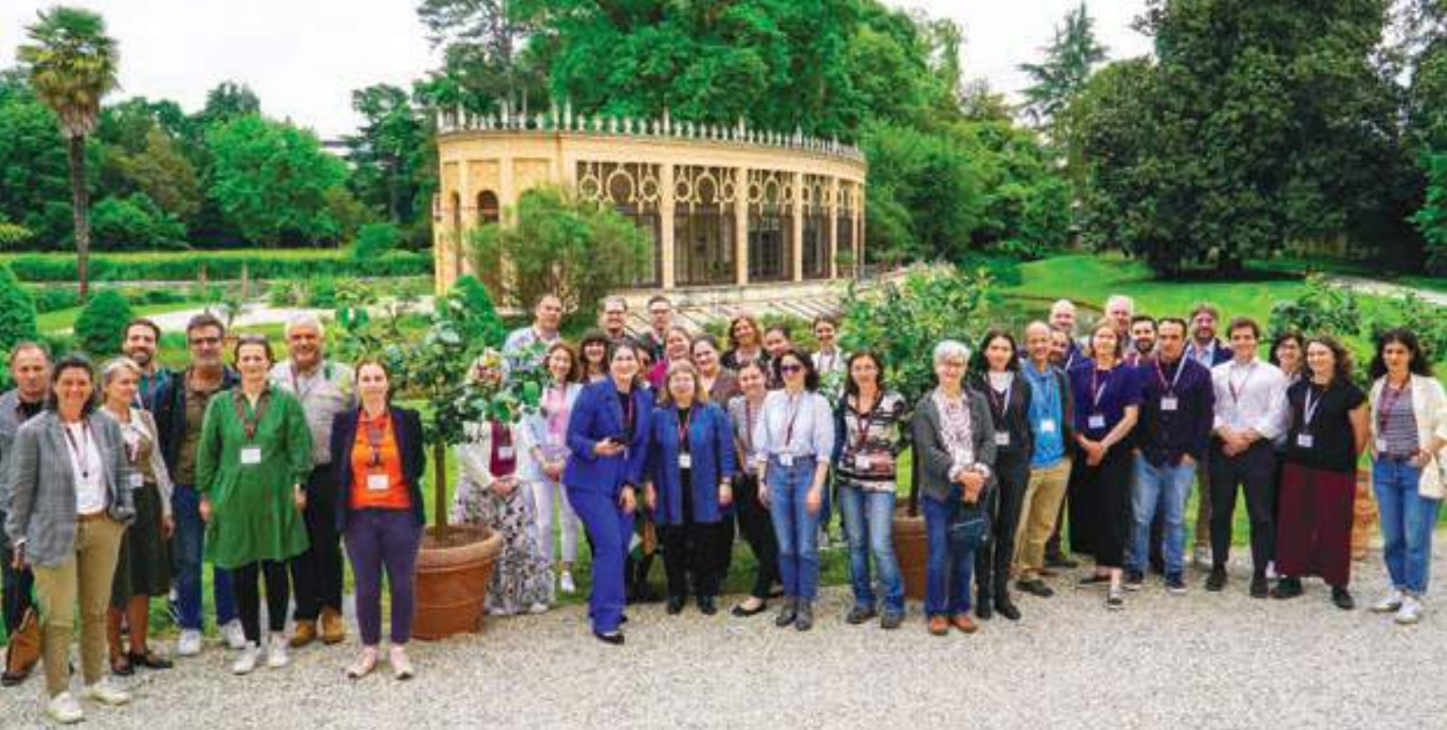
LIFE ENABLE end-of-project networking event in Castelfranco Veneto, Italy.