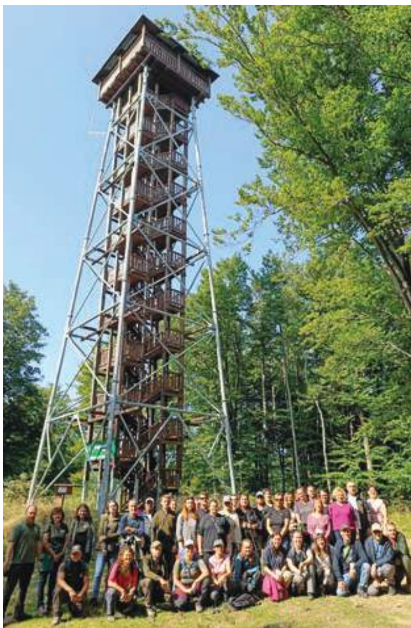
By the tower on Jeleniowaty in Poland.

Watch the webinar on carrying capacity here.