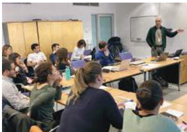
Participants of the MPA4Change project at the kick off meeting.