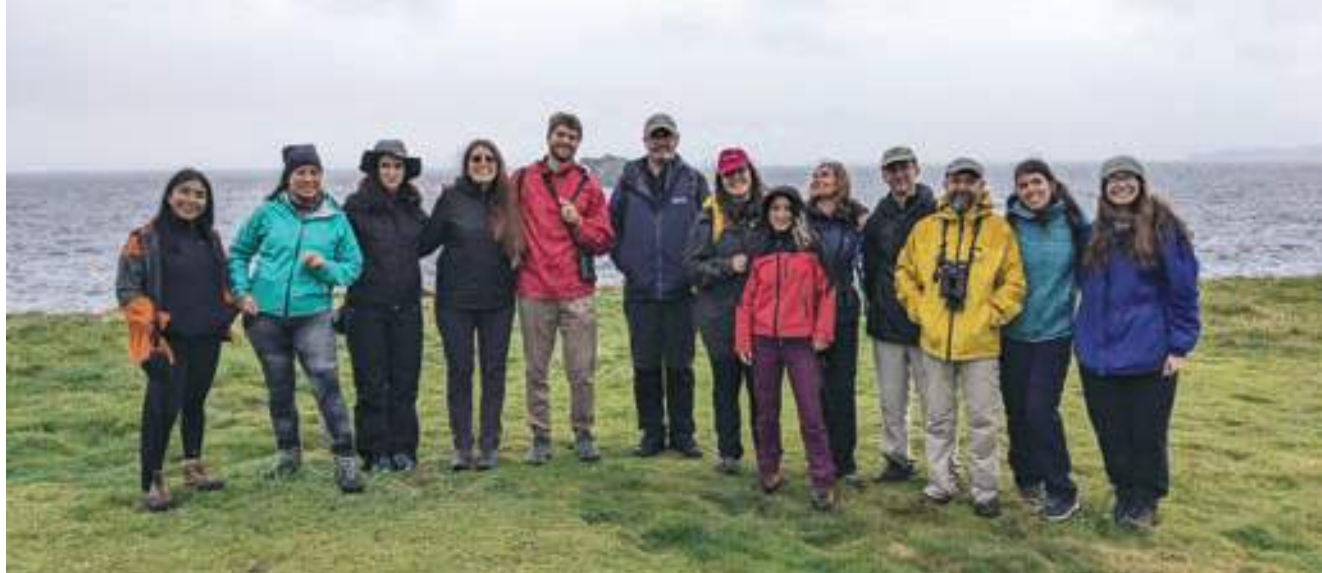
Students during a field visit as part of the Master's Degree in Protected Areas.