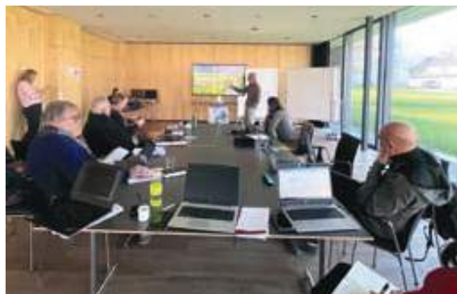
HPHPe and Periurban Commissions meeting in Siggen, Germany.