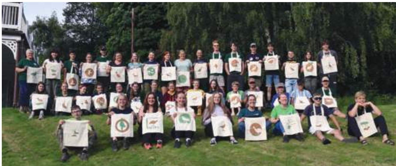
International Junior Ranger Camp.

Learn more about the GREENHEALTH Learning Event here.