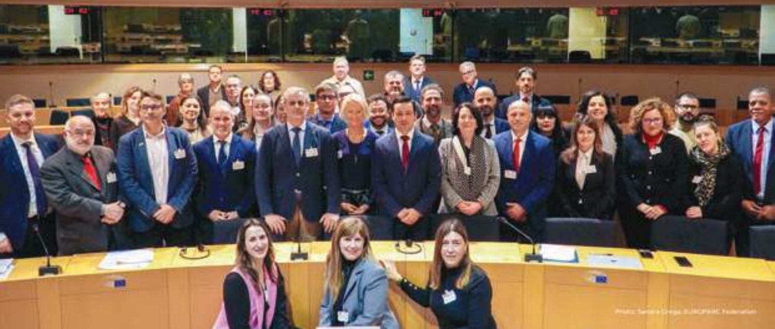
ECST Award ceremony at the European Parliament in Brussels, Belgium.