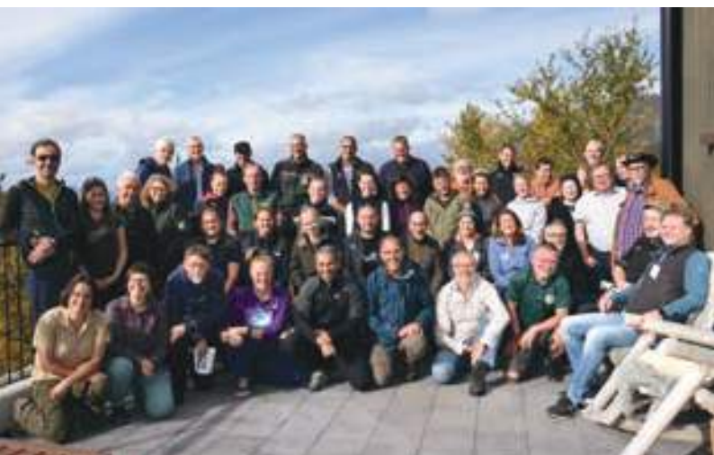
Participants of the TransParcNet Meeting 2024.