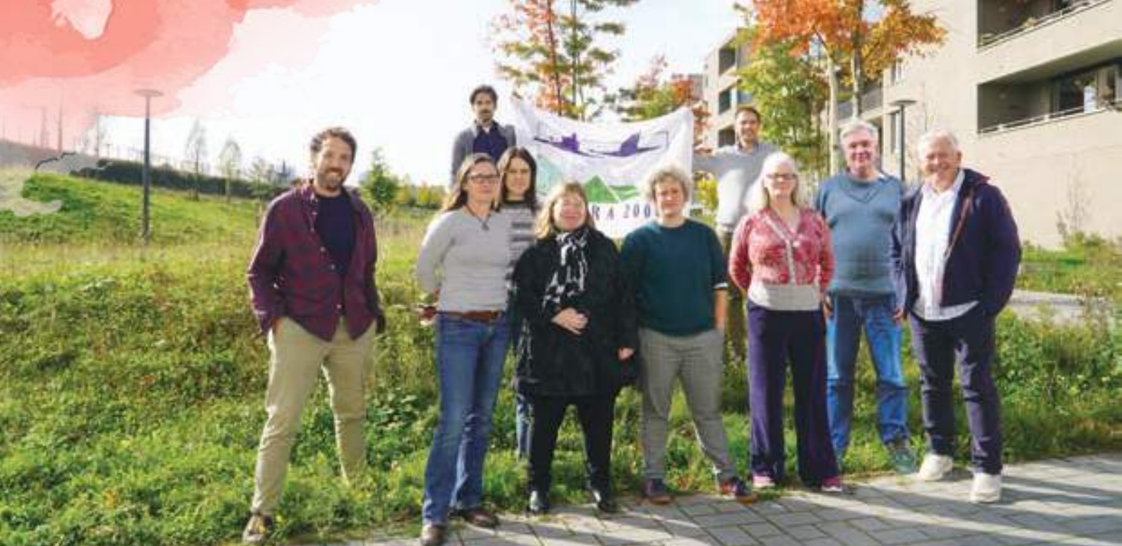
PAME Europe Kick-Off Meeting in Regensburg, Germany.