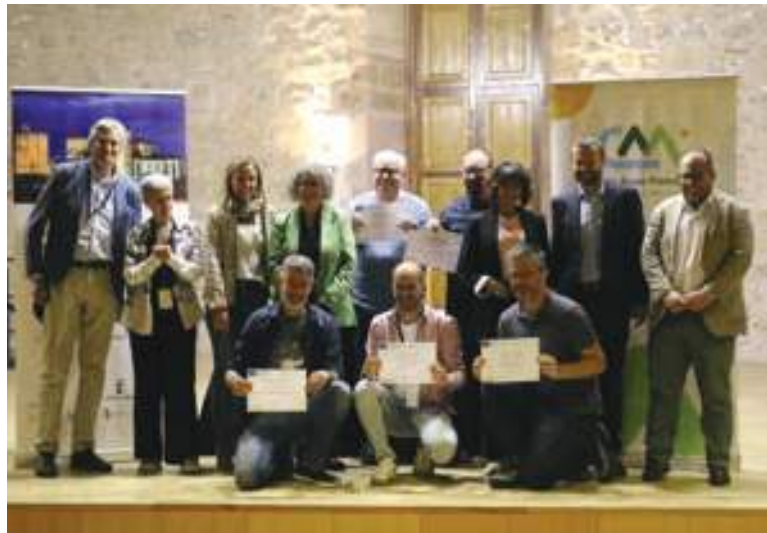
Ceremony of the third "Inspiring Experiences in Protected Areas Award", promoted by EUROPARC Spain.

In the "Other Entities" category, the award recognised the "Integral management of the Buixcarró Reserve" project, developed over 20 years in the Serra de Mariola Natural Park by the Victoria Laporta Carbonell Foundation.