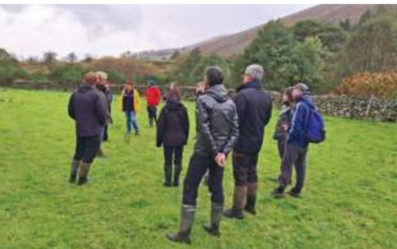
Cumbria National Park in England.

Watch the Yorkshire National Parks presentation here.