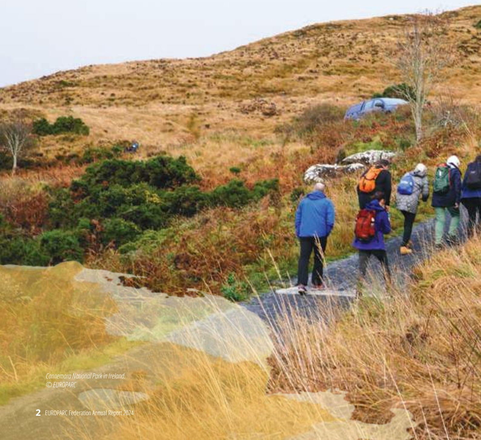
Connemara National Park in Ireland.

Across the network, we foster collaboration to generate collective insights and expertise for Protected Areas policy and practice. Through cooperation and being open to continuous development, we stimulate innovation and mutual learning. Our vision of Sustainable Nature; Valued by People remains a shared ambition, supported and championed by our Members.