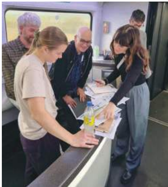
Climate change game on the train.

We organised a joint networking event, hosted by EUROPARC Atlantic Isles and the Low Countries Section. The event highlighted the importance of cross-border collaboration and 'out of the box' thinking to ensure the resilient nature and landscapes for the future. Our journey started with a field trip in National Park Zuid-Kennemerland, where participants shared thoughts and experiences about the adaptive capacity of nature and people and the importance of communication. The dynamic landscape inspired lots of ideas, and participants were encouraged to 'dare to dream'!