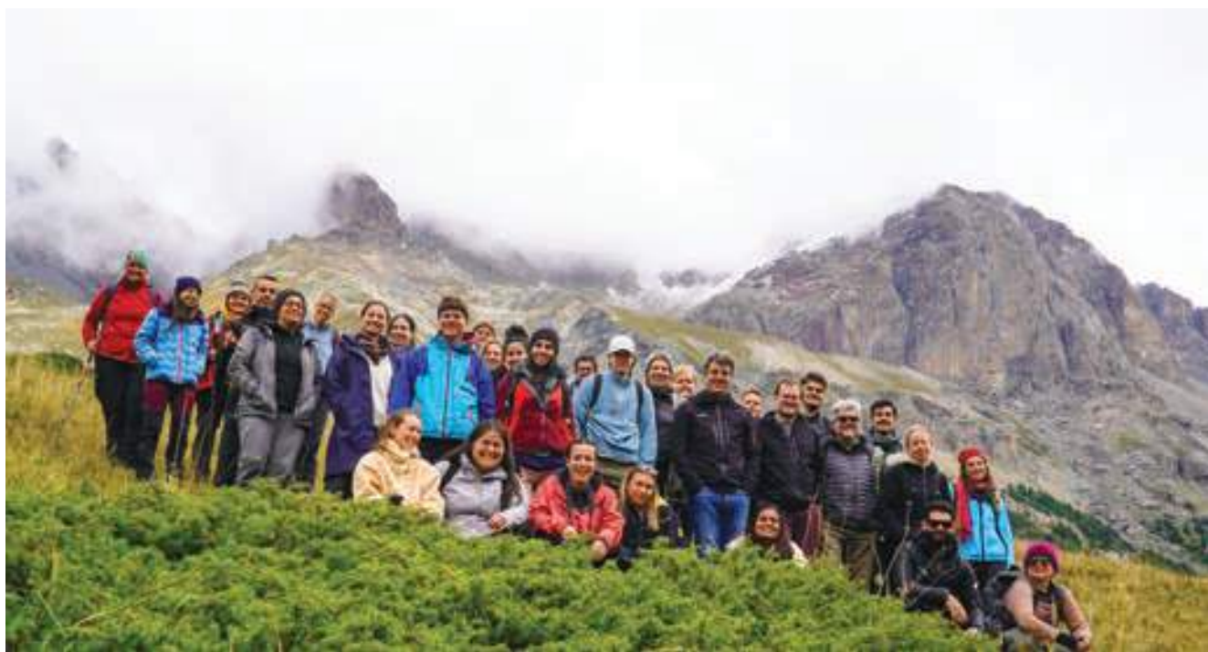
Participants of the NaturaConnect Annual Consortium Meeting 2024 in Grenoble, France