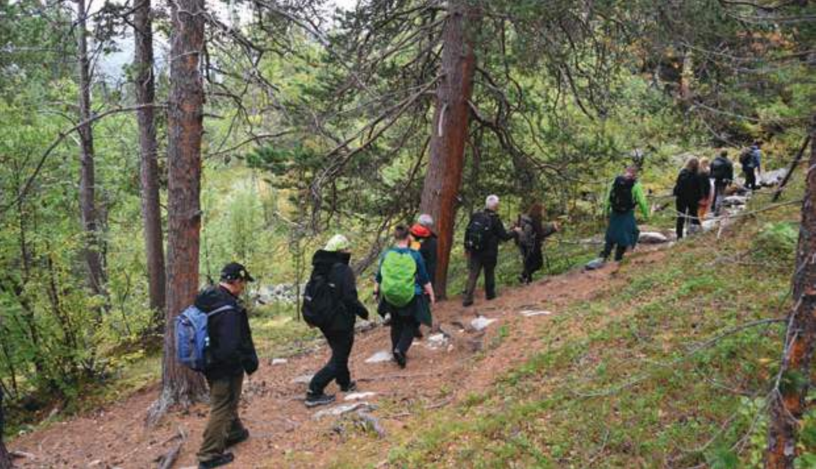
Háldi Transboundary Area, Finland and Norway.